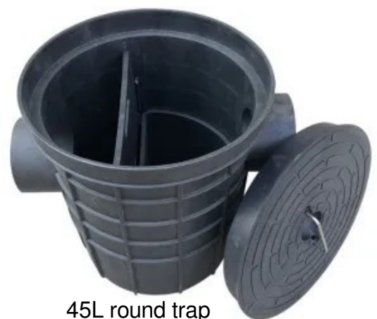
45L round trap