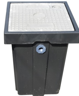
65L grey water pump chamber >