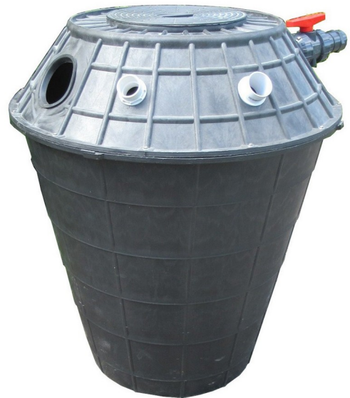
std 320L conical sewage tank