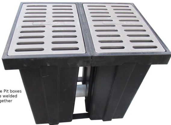
Dual Pit Box units, 280 or 340L