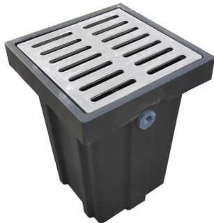
< 65L storm water sump

Technipump Ltd can assemble from stock a wide variety of sumps, and pump chambers. Within these, we can install a wide range of pumps with pipework and non-return valves, to suit most applications for drainage, storm water and sewage.